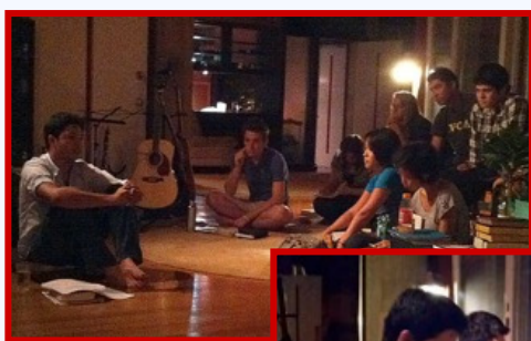
This generation is raising up leaders for today's ministry.